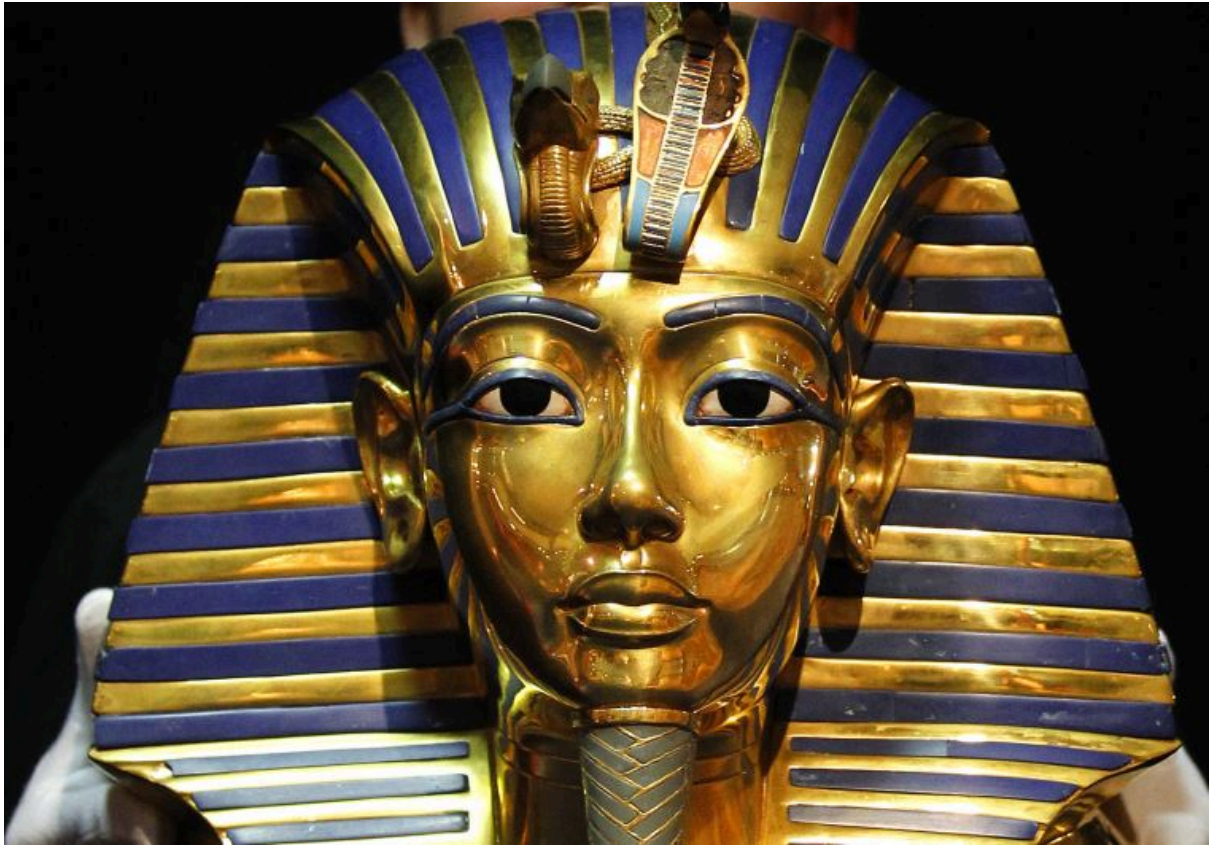
-High Priest Hooded Cobra 666