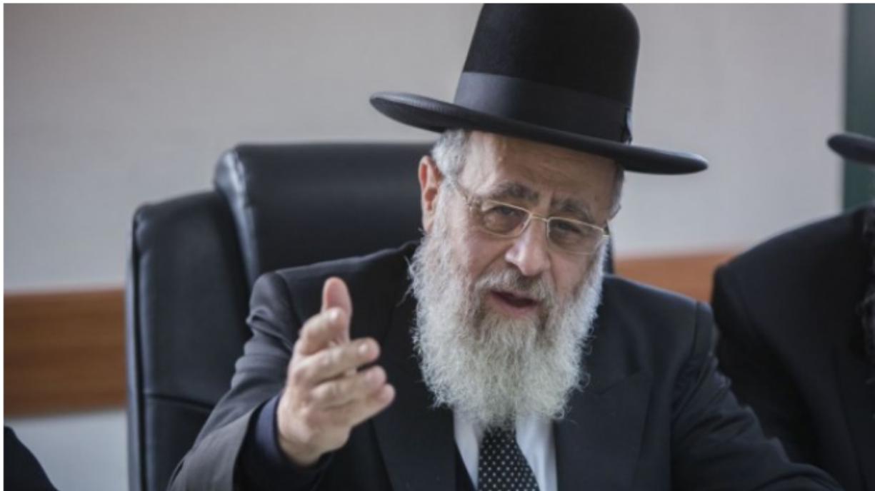
Sephardic Chief Rabbi Yitzhak Yosef.

http://www.timesofisrael.com/chief-rabb ... in-israel/